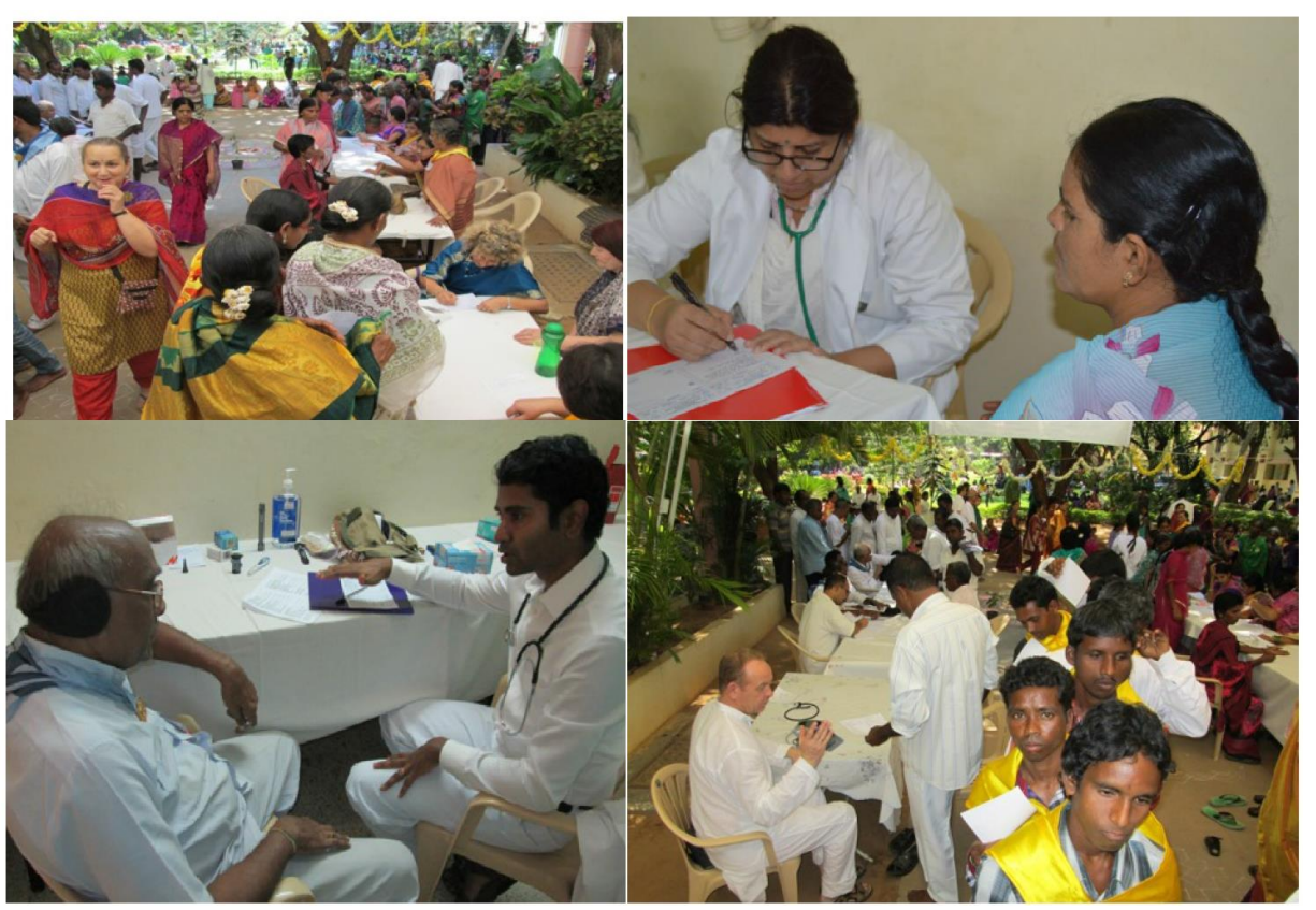
During November 2014 Birthday Medical Camp