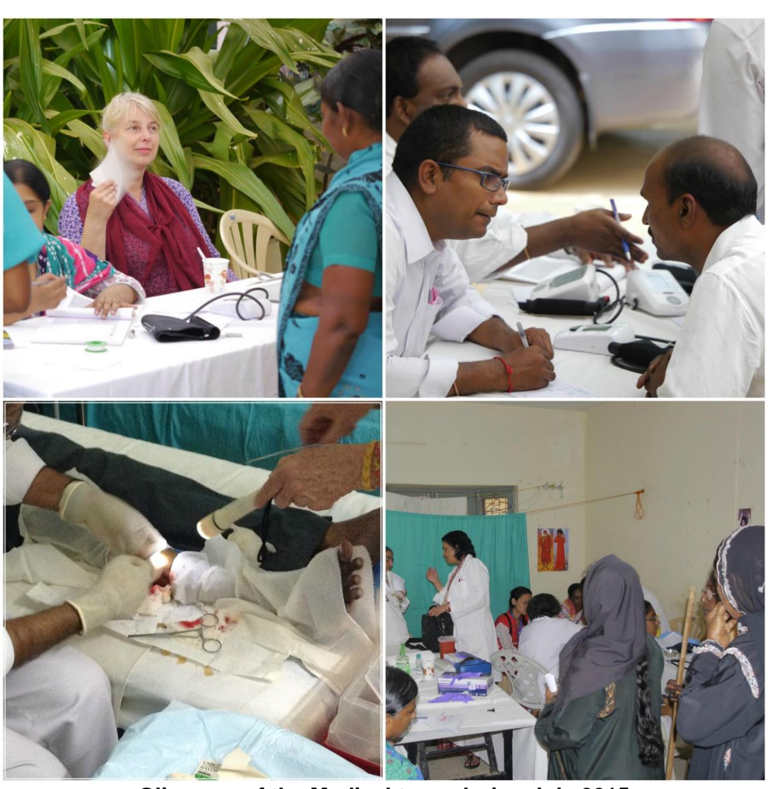
Glimpses of the Medical team during July 2015

Acute care services such as inhalation pulmonary treatments, wound care and Intravenous fluids and antibiotics administration are part of these camps in addition to medical management of acute and chronic medical issues. Additionally, health education is provided. Patients who need acute care are transferred to either the Sri Sathya Sai General Hospital or the Sri Sathya Sai Institute of Higher Medical Sciences (Super Specialty Hospital), Prasanthigram for further diagnosis and treatment.