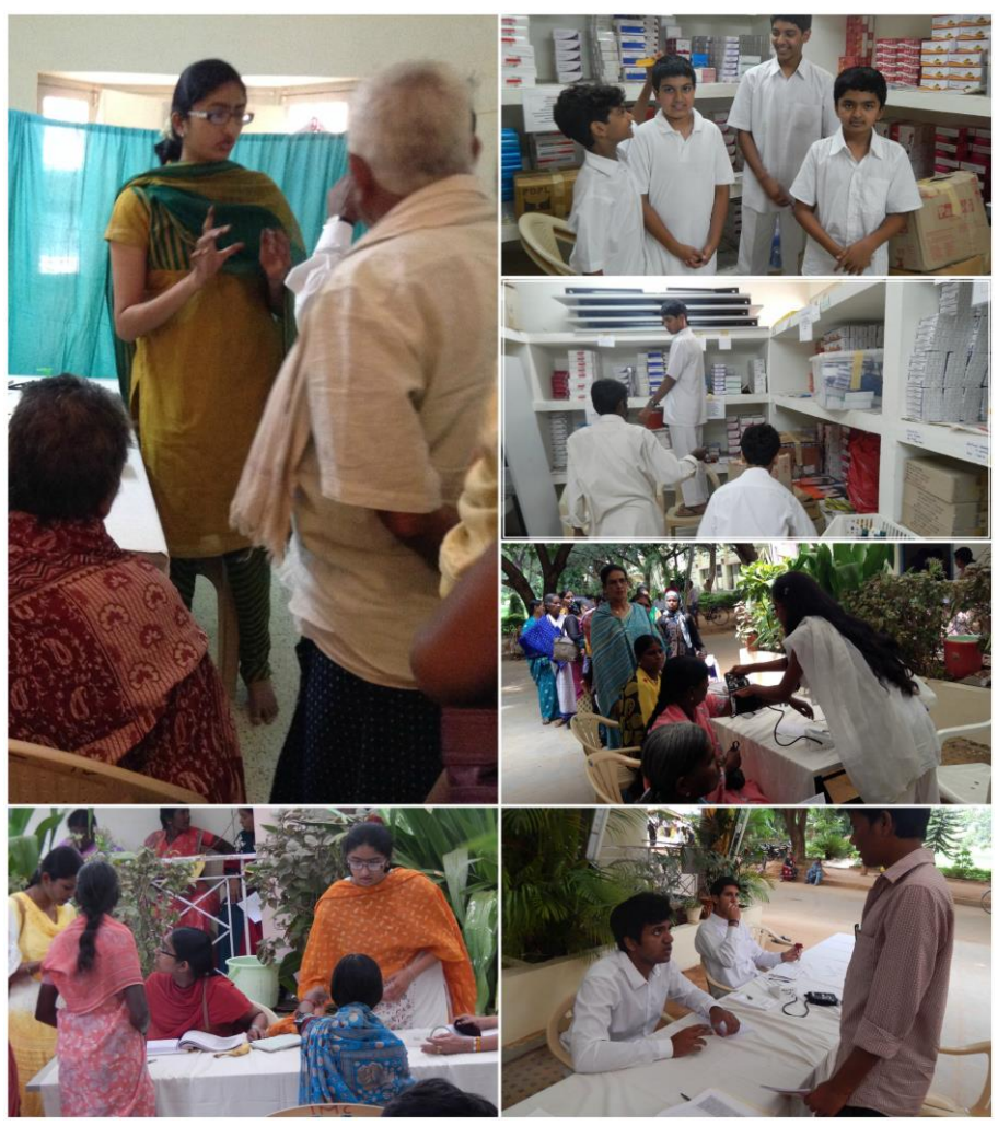
Young adults in action at Registration, Translation and Pharmacy.

These Medical Camps also provide a blessed opportunity for Young Adults (medical professionals, medical students, and non-medical persons) to take an active role in organizing these medical camps and participating in various activities, including direct patient care for medical volunteers, and camp set-up, registration, patient assistance, and pharmacy inventory maintenance, for non-medical volunteers.